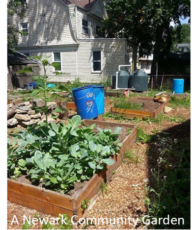
A Newark Community Garden