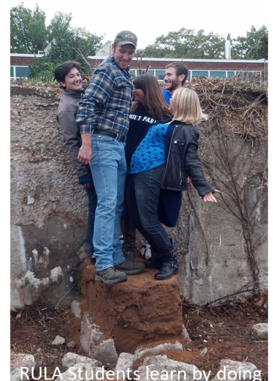
RULA Students learn by doing